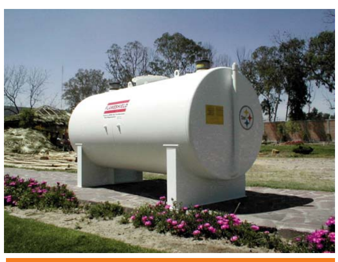
2-Hour 2000° fire-tested performance

FLAMESHIELD aboveground storage tanks are manufactured with a tight-wrap double-wall design. Standard features include 2-hour fire-tested performance, built-in secondary containment and interstitial monitoring capability.