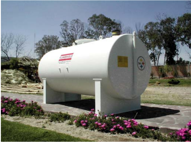
2-Hour 2000° fire-tested performance

FLAMESHIELD® aboveground storage tanks are manufactured with a tight-wrap double-wall design. Standard features include 2-hour fire-tested performance, built-in secondary containment and interstitial monitoring capability.