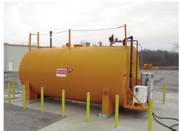
Compatible with a wide range of fuels and chemicals, including biodiesel and ethanol